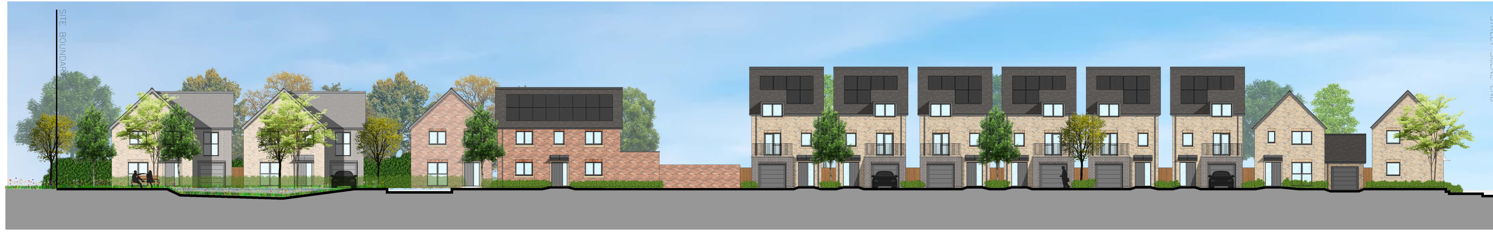
Street Scene A-A Scale 1:200 @A1

DO NOT SCALE FROM THIS DRAWING All dimensions to be checked on site prior to manufacture of prefabricated items. Any discrepancy or query to be reported and clarified before associated work proceeds. All construction to be in accordance with relevant Trade and Professional Standards and Guidelines, Statutory requirements and product manufacturers' specifications. Read in conjunction with Finishing specifications, Workmanship specification, all other associated drawings issued and details which may be issued from time to time.