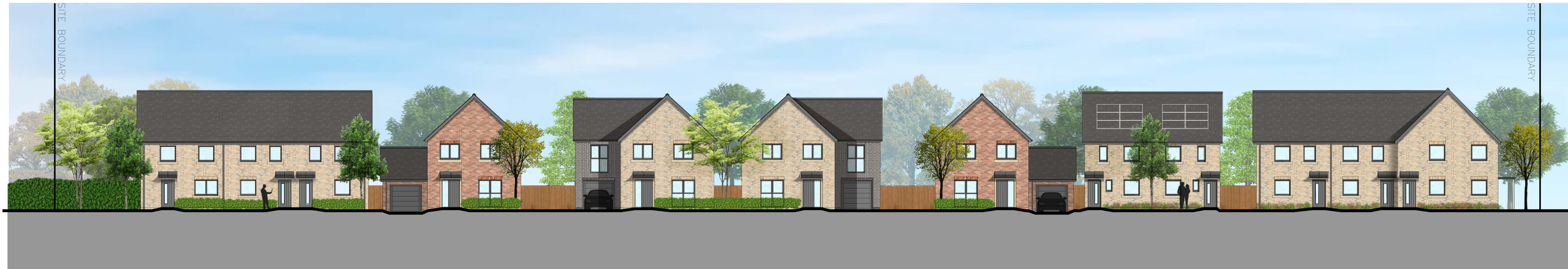
Street Scene C-C Scale 1:200 @A1