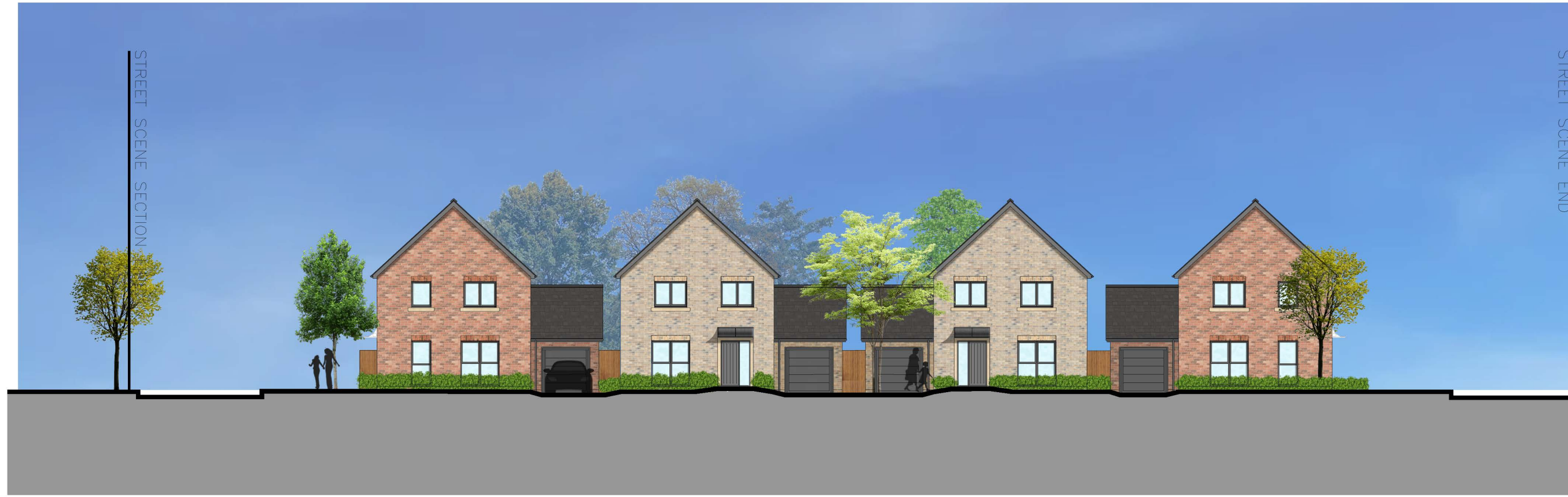
Street Scene B-B Scale 1:200 @A1